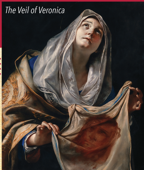
The Veil of Veronica

St. Carlo Acutis, the first millennial to be canonized, cataloged the International Vatican Exhibition "Miracles of the Eucharist," and it will be on display!