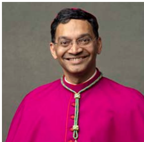
BISHOP EARL K. FERNANDES Bishop of the Diocese of Columbus

For table package information and purchase, scan the QR code or visit ffhl.org/regions/columbus/rsvp .